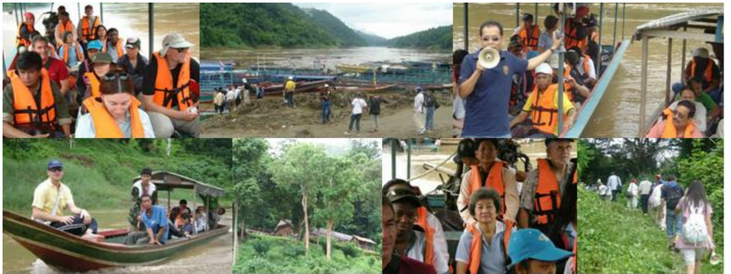
Peace Fellows on a field trip